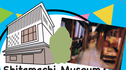
Shitamachi Museum Museum closed due to renovation.