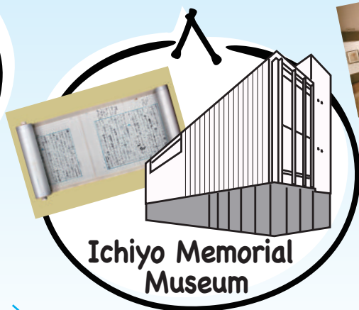
Ichiyo Memorial Museum