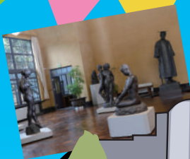
ASAKURA Museum of Sculpture