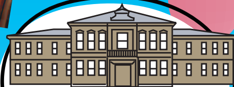
Sogakudo of the Former Tokyo Music School